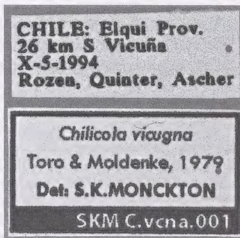
Fig. 2. Labels attached to proposed neotype specimen SKM C.vcna.001.

(ii) The proposed neotype exhibits the characters listed above as differentiating Chilicola vicugna from other species in the subgenus namely, a short malar space, and first flagellomere shorter than the pedicel; these characters are missing from the existing holotype and the only male paratype;